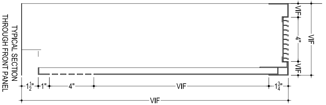
TYPICAL SECTION THROUGH FRONT PANEL

INTERIOR METALS 255 48TH ST. BROOKLYN NY, 11220 (718) 439-7324